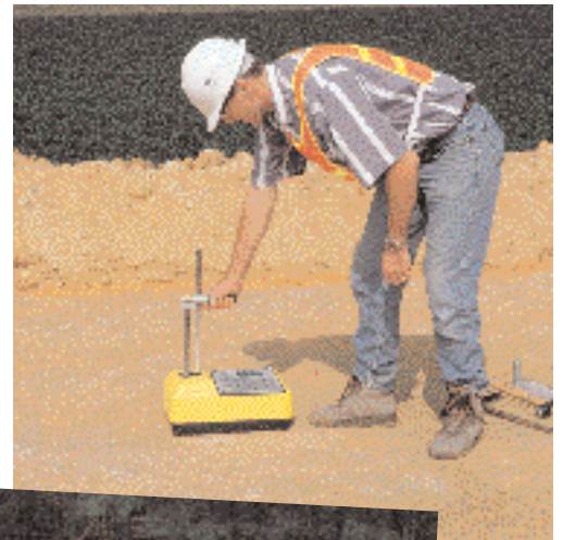
Soil and Aggregates