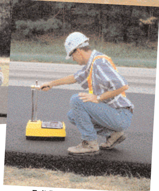
Full Depth Asphalt or Concrete