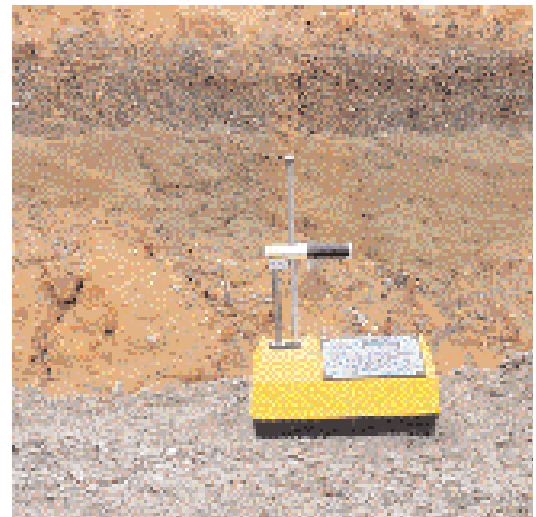
RoadReader™ Plus is versatile, quick and economical.