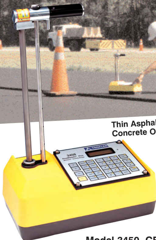
Model 3450 CE