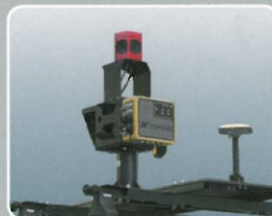
IP-S2 Vision Sensor Unit