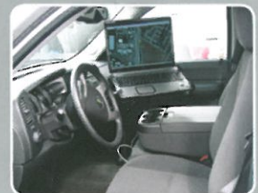
Easy to use and compact

Your local authorised Topcon distributor is: