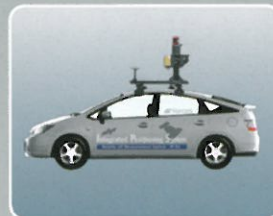
Portable, Easy Mounting System